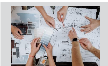
Implement complex projects